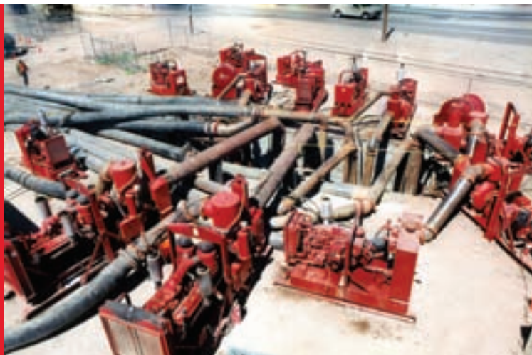
Hydraulic power units and variable-use, vacuum-assisted non-clog pumps used on a bypass project in Phoenix.

Bypass pumping: A key component of many sewer rehabilitation projects