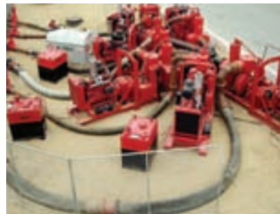
A 30-in. sewer line project in southern California. The equipment was sized for a peak flow rate of 24 mgd and consisted of four primary pumps and two standby pumps.