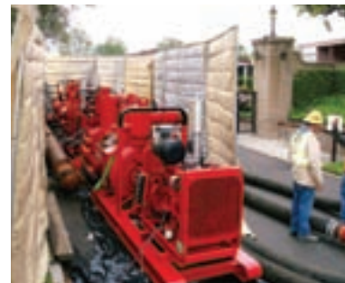
A 7.1 mgd sewer bypass job for the Irvine Ranch Water District in Lake Forest, Calif. Three bypass pumps were installed at a remote location and plumbed back to the manhole because access and space to the site were limited.

EUROPE, AFRICA & MIDDLE EAST Toray Membrane Europe AG Münchenstein, Switzerland Phone: +41-61-415-8710