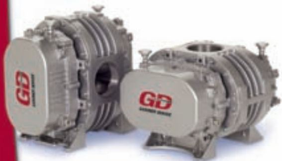
GD Sutorbilt® Legend® DSL Series – Dual Splash Lubrication

Proven results make it legendary. Advanced technology makes it cool. Gardner Denver makes it a reality.